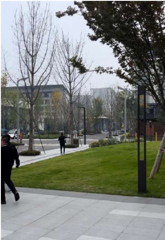
Picture 7 Athletes Village Environment