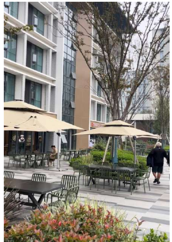
Picture 6 Athlete Village Environment