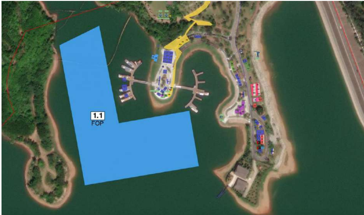
Picture 3 Provisional setup of the race venue