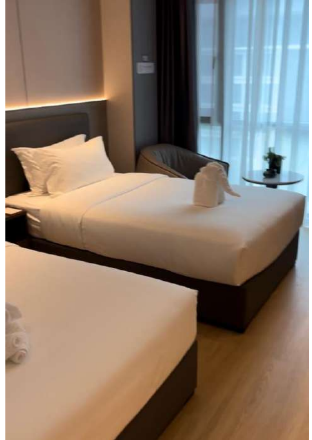
Picture 5 Athlete Village double room picture