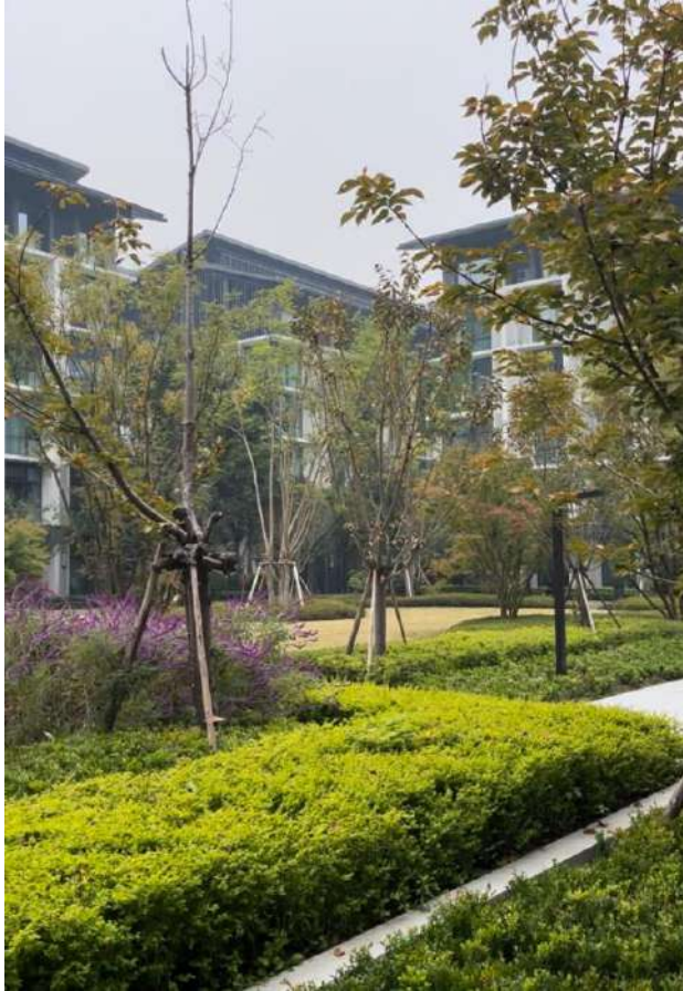
Picture 4 Athlete Village Environment